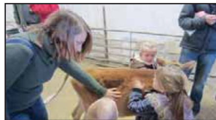
Potential buyers looking over the cows before the sale.