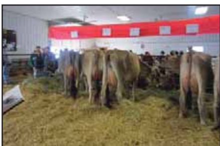
Nice sized crowd in attendance for the Spring Sale.