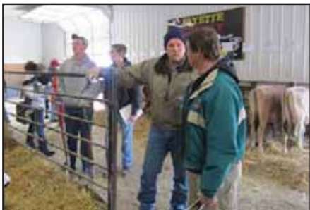
Group of nice young cows waiting for the sale to begin.